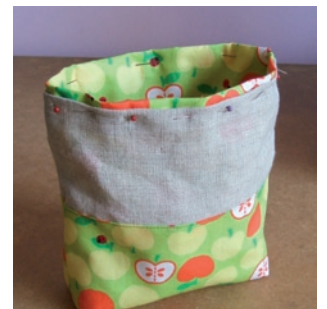
Top of bag pinned