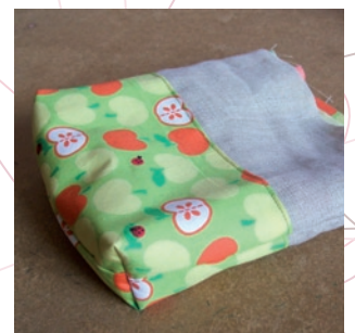
Ready to do the top seam