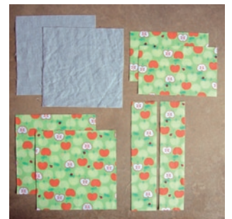
All pieces cut out

Take the half panel pieces, and fold over one of the long edges, it doesn't matter how much you fold over, as long as both pieces are the same so when the whole bag is stitched together it looks right :) Iron this flat, and mind your fingers :)