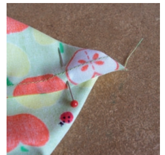
pin corner for gusset