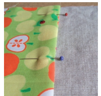
Pinned ready to iron, then stitch