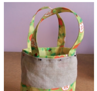
Handles pinned in to stitch