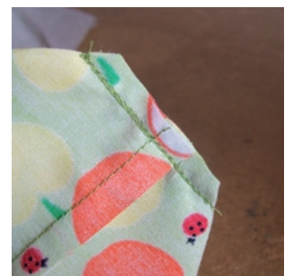
Trim corner off after stitching