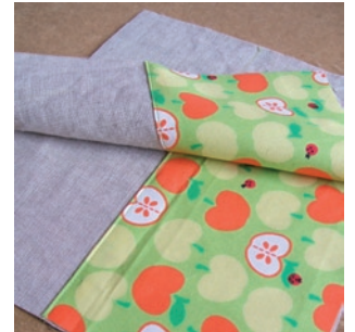
Place pieces together to sew

So now the main body of the bag is formed, turn the bag so on the outside you have the plain and patterned, and the total patterned on the inside, looks great, now lets do the handles!