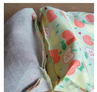
Pin inner and outer together to sew