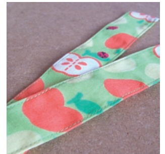
Turned out handles and top stitched